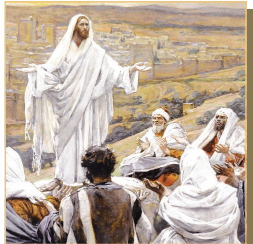
"I tell you, if he does not get up to give the visitor the loaves because of their friendship, he will get up to give him whatever he needs because of his persistence." - Lk 11:8