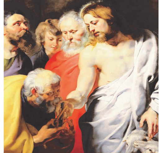
Then he said to them, "But who do you say that I am?" Peter said in reply, "The Christ of God." - Lk 9:20

10 H. PUTNAM EXT, CHARLTON, MA 508-248-7862 FAX: 508-248-5832 Mailing Address: P.O. Box 338, Charlton City, MA 01508 Email: stjoecharlton@aol.com Website: www.stjosephscharlton.com