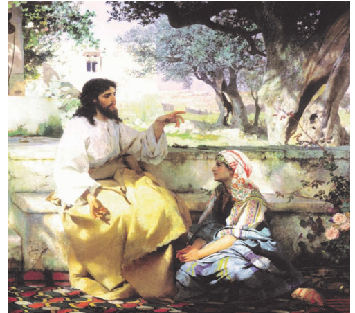
The Lord said to her in reply, "Martha, Martha, you are anxious and worried about many things. There is need of only one thing. Mary has chosen the better part and it will not be taken from her." - Lk 10:41-42

10 H. PUTNAM EXT, CHARLTON, MA 508-248-7862 FAX: 508-248-5832 Mailing Address: P.O. Box 338, Charlton City, MA 01508 Email: stjosephcharlton@aol.com Website: www.stjosephscharlton.com