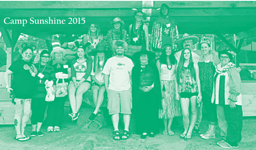
Camp Sunshine 2015